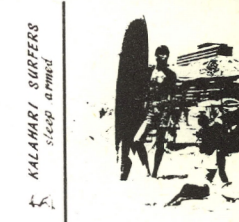
KALAHARI SURFERS Sleep Armed