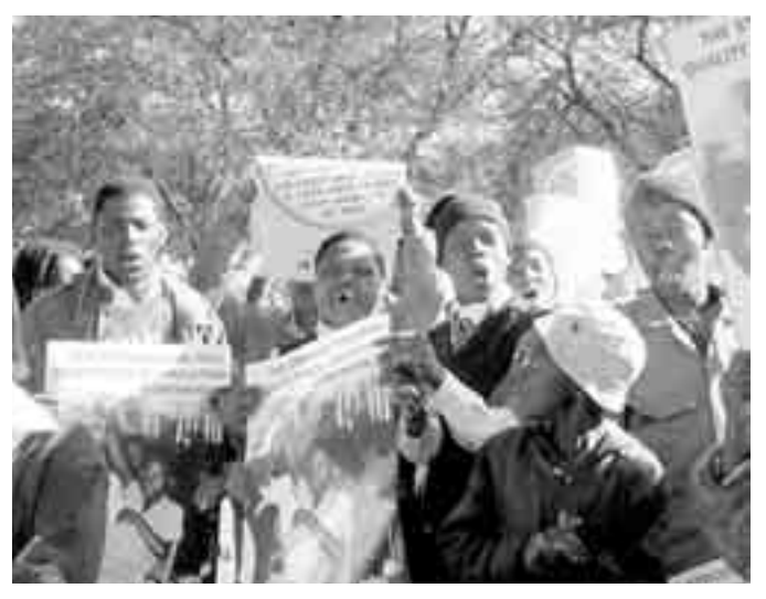
"The struggle for free, quality public education continues"

In many schools Grade 11 and 12 learners complain about the fact that they have to rely upon their fellow learners for learning and understanding subjects. There are not enough properly trained teachers in our schools particularly in subjects such as maths. The new education system in the schools has been challenging our educators because they have not been trained to adapt to post-apartheid educational challenges. These educators were trained under the apartheid era. They have not been introduced to new and progressive education methods. Students have called for the retraining of educators.