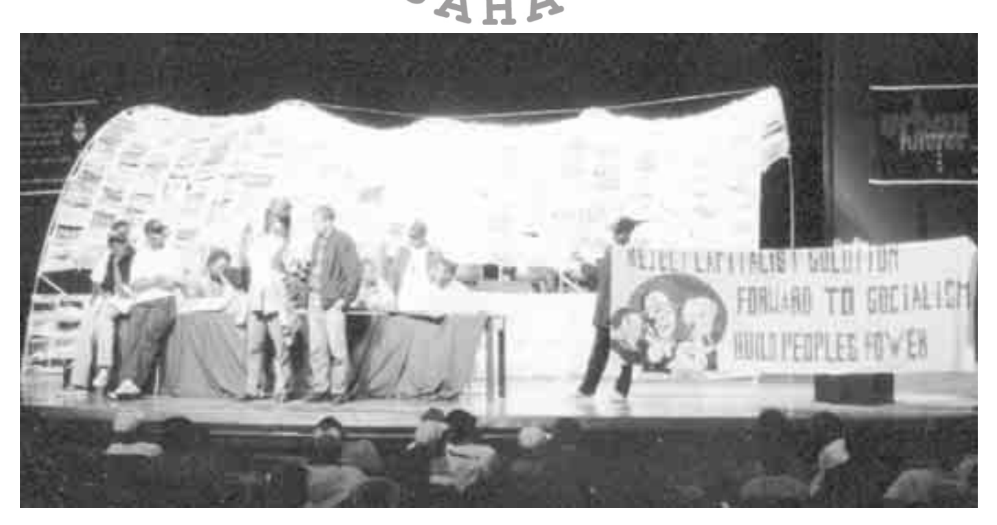
Student and worker alliance July 14, 2000: Urban Futures conference, Wits University.

However, it was events in the Vaal region that transformed student protests into a major political struggle. In August 1984, rent and service costs were increased in the townships around Pretoria, the East and West Rand of Johannesburg, the Eastern Cape and the Vaal Triangle. The Vaal exploded. Rent and education boycott converged in a wave of anti-