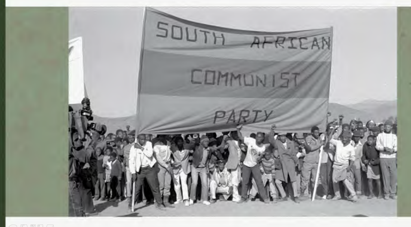
ONE OF THE LARGE SACP FLAGS BOLDLY DISPLAYED IN CRADOCK IN 1985.

The Kabwe conference also reaffirmed the enduring relationship between the ANC and the SACP, with the seminal role of communists in non-racial organization cited as a cornerstone of the alliance. A few weeks after the conference, the state-run South African Broadcasting Corporation televised the most flagrant public defiance to date of the ban on the SACP: the unfurling of the Party flag at a mass funeral of four assassinated UDF leaders in the Eastern Cape village of Cradock.<sup>2</sup> Another milestone for the SACP came in 1987, when government released imprisoned ANC and CP veteran Govan Mbeki: he immediately pledged his continued dedication to the communist ideals for which he was imprisoned. When seven top political prisoners of the ANC and SACP were released in 1989,<sup>3</sup> their Soweto welcome rally was a living embodiment of the alliance,<sup>4</sup> in terms of the flags, chants and speeches in support of both organizations. Such daring public promotion of the SACP symbolized the ultimate challenge to the state more than it reflected the degree of popular support<sup>5</sup> for the party. Even non-CP members backed this assertion of the democratic right of all political organizations to exist and to campaign openly. For the SACP itself, it was a demonstration of the party's concerted effort to raise its own profile — a departure from the past emphasis on its partnership with the ANC.