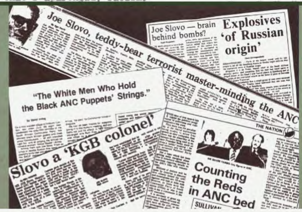
THE MAINSTREAM MEDIA PORTRAYED THE ANC AS COMMUNIST-CONTROLLED, AND THE SACP AS WHITE-DOMINATED - WITH SLOVO SAID TO BE DOING MUCH OF THE DOMINATION. (SOURCE: FREDERIKSE, JULIE. THE UNBREAKABLE THREAD: NON-RACIALISM IN SOUTH AFRICA. RAVAN PRESS, 1990)

The whites now face a crisis, and therefore an appreciable number are moving not completely to our side, but certainly moving against - they are what I would call part of the forces for change, at least these groupings, not necessarily by the revolutionary forces, and I think I must distinguish between the two things, and I think all forces for change, whether they agree with us or they don't, have got to find a place in this line-up of - of trying to destroy things that we think commonly should be destroyed - that's apartheid, racism.