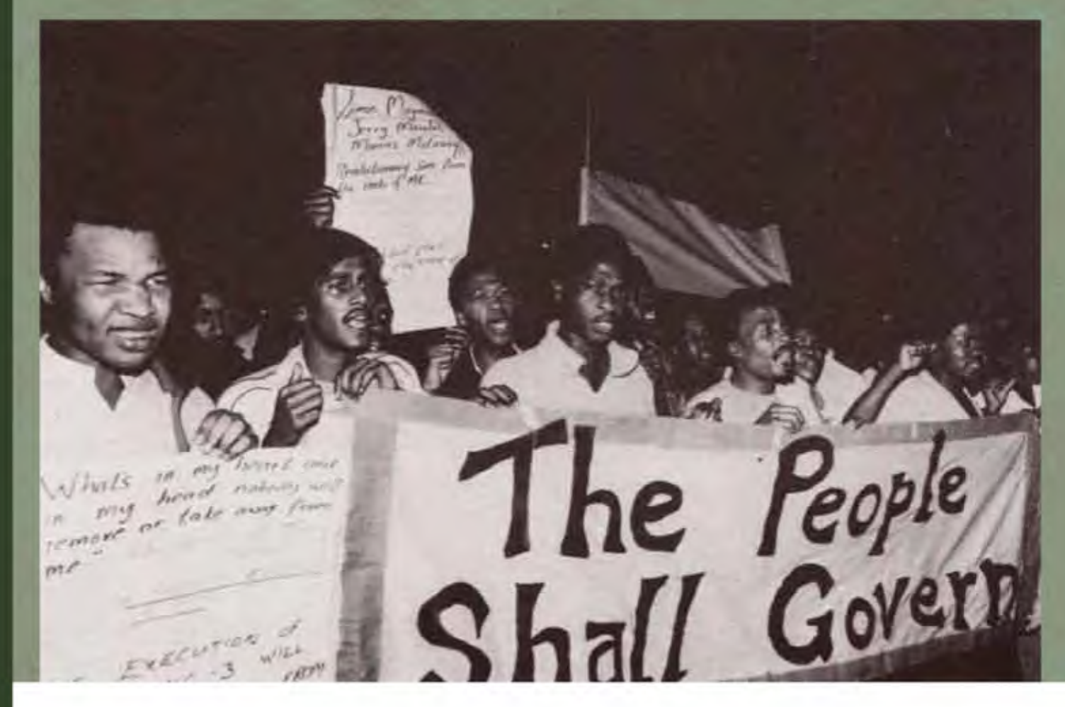
AFRICAN AND INDIAN ACTIVISTS JOINED TOGETHER TO PROTEST THE HANGING OF THREE ANC CADRES.