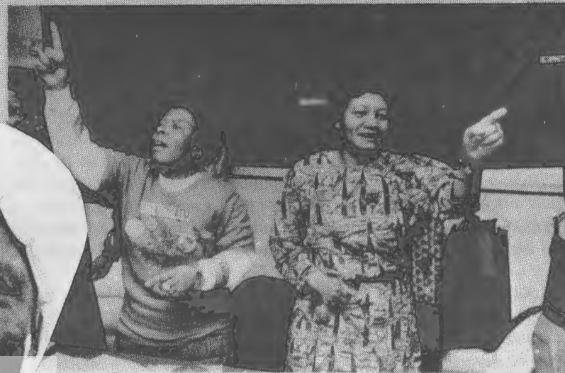
IN THE TRADE UNIONS IN THE MASS DEMOCRATIC MOVEMENT IN THE NATIONAL LIBERATION MOVEMENT