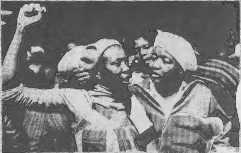
WOMEN FIGHT ON ALL FRONTS